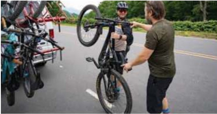
Mountain Top Shuttles