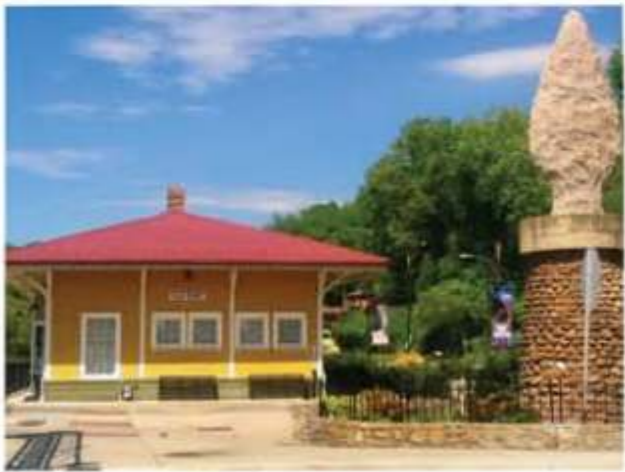
Old Fort Train Depot and Arrowhead

The Curtis Creek Area is included in the county's 70,000 acres of Pisgah National Forest. This hardwood forest hosts numerous trails, waterfalls, creeks, aquatic life and wildlife. It includes a seasonal, primitive campground and small RV area.