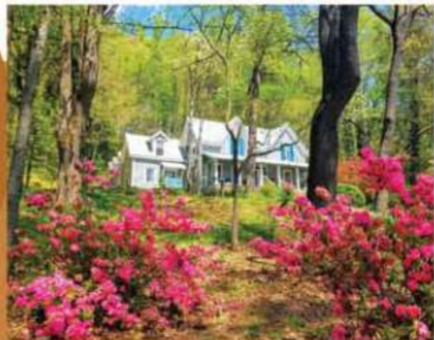
Below: Mountain Appalachian Inn