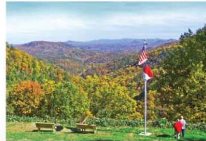
The Royal Gorge view from Point Lookout Trail is spectacular, year-round.

Curtis Creek Road is an eleven-mile road that is partially paved, but mostly dirt road ascending to the Blue Ridge Parkway. Popular with hikers, mountain bikers, and equestrians enjoying the Old Fort Gateway Trail System. Watch for signs. Curtis Creek is a delayed harvest trout stream, all N.C. Wildlife regulations apply.