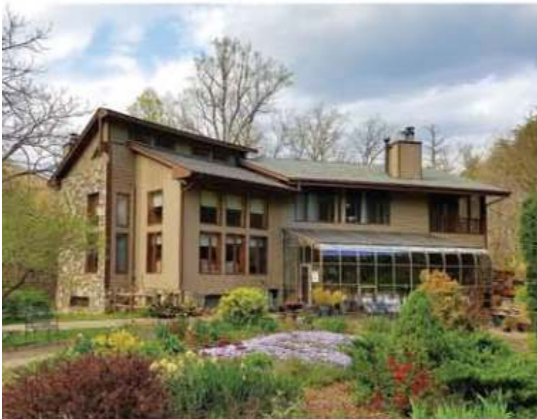
Above: Inn on Mill Creek