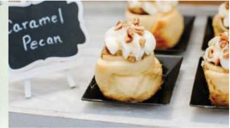
Go-Go's handmade caramel pecan buns.